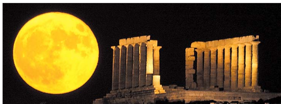
A full moon rises behind the ancient temple of Poseidon in Sounio, Greece, in July.

The agency unveils details of its new exploration plan, described as 'Apollo on steroids.'