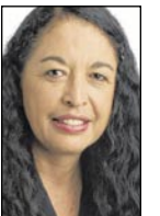
See BUCHER, 8A ▶ Bucher

a new remote reporting system. That system, coupled with modems scheduled to be added to all of the county's ballot scanners later this year, should end years of slow ballot counting that at times has been the worst in the state.