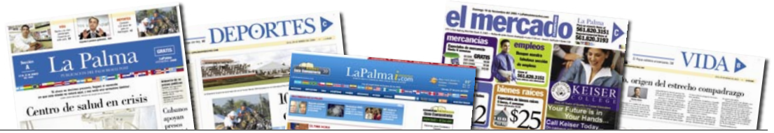
Tabla de precios por módulos de frecuencia al por menor

LA PALMA - COMPRA DE AVISO MÓDULO - EL PROMEDIO DE COSTO POR AVISO